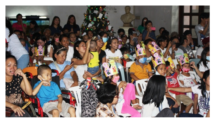
Cancer Institute pedia patients enjoying the program & gift giving