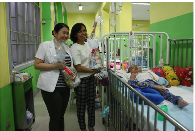
Samsung representative being assisted by a Resident Physician at pedia ward