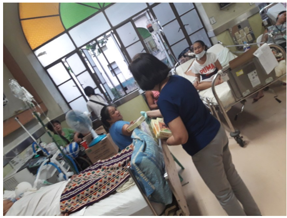
Distribution of Enervon Prime at Ward 1