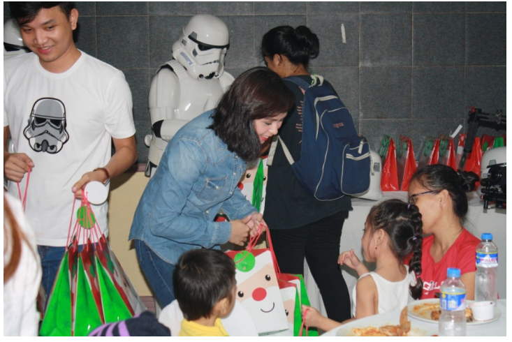
Globe Ambassadors at the Cancer Institute Auditorium distributing for the pedia cancer patients

Adult patients at PGH wards 1 and 3 were not left out when one hundred thirty (130) boxes of Enervon Prime were distributed to them 8 December 2016 from Unilab Corporation. The PGHMFI staff took time to mobilize the gift giving to these patients.