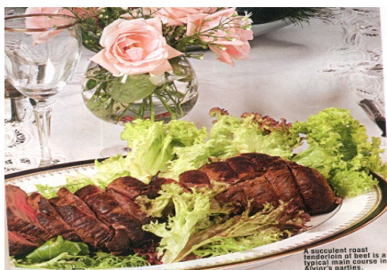
From: Food Magazine, Published Dec. 2003— Jan. 2004 Issue