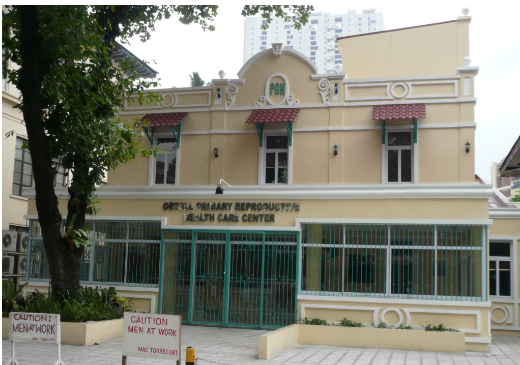
Facade of the Ortoll Primary Reproductive Health Care Center