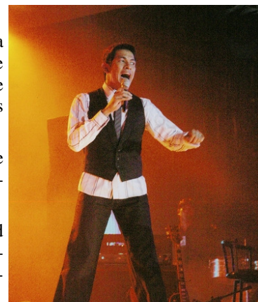
During the Gala Night for the PGH Centennial at the Manila Hotel—2007

Helping PGH offers us the opportunity to be of service to the unfortunate members of our society. Hence our service to PGH, which we give through PGHMFI, is a privilege which some of us are lucky to offer.