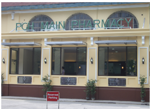
Renovation of PGH Main Pharmacy—2005