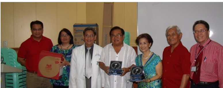
Assorted Medical and Surgical Supplies donated to the Dept. of Family and Community Medicine—2012

These are given to the Central Block Pharmacy, Surgery Department and other Departments in need