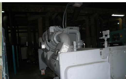
Renovation of Ward 15—2007, Renovation of Left Central Block 5—2008, Right Central Block 5—2009, Acquired Air Conditioning Chiller—2010, Renovation of Right Central Block 1-6 (one section) - 2010. Funded by Coca Cola Foundation through its donations of USD 1M

Renovation of Directors Media Room—2005, Renovation of OB Labor, Admitting and Operating Rooms—2006 Renovation of UPMASA-PGH Science Hall—2007 Donated by UPMASA, Renovation of Dietary Lounge—2007 Construction of PGH Centennial Marker (Electronic Billboard) - 2007, Renovation of OPD Toilets—2010, Renovation of ABG Unit—2012