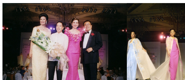
1st Grand Fund-Raising Event of PGHMFI in 2004 dubbed "Night of Fashion" by Pitoy Moreno at the Westin Philippine Plaza