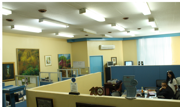
New Office of the PGH Medical Foundation