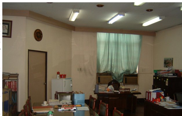
Old Office of the PGH Medical Foundation

Our progress can be measured by our contributions to PGH and our patients from start of operations in 2003 up to the present, March 2013.