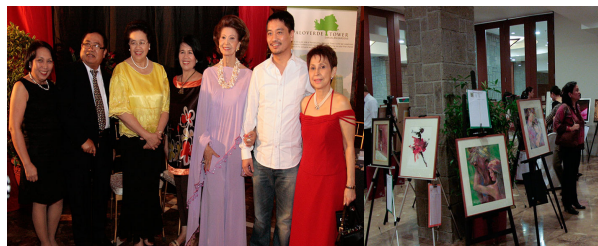
Biennial Art Auction of the PGHMFI usually held during Month of Hearts at the Manila Polo Club

Last year, the foundation celebrated its 15 th anniversary by holding its first 'Donor's Night', a thanksgiving party for friends and donors who have continuously supported the foundation over the years. It was also an occasion to welcome our first set of Board of Governors, and to launch the foundation's latest fundraising drive I AM PGH, a Php100 million campaign for the foundation's endowment fund.