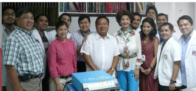
Cautery Machine donated to the Division of Urology, Dept. of Surgery—2012