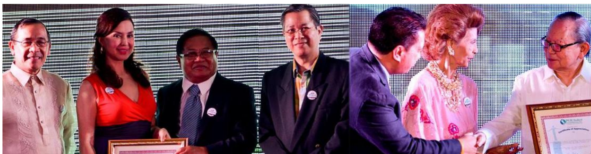
The 15th Anniversary of the PGHMFI and Donors Appreciation Night at Tower Club, Philam Life Bldg., Makati City—2012