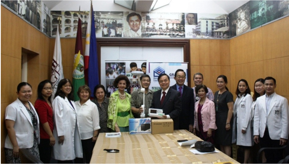
The donors (shown at 7th and 8th from right) with officers of the PGHMFI and officials and staff of the PGH.