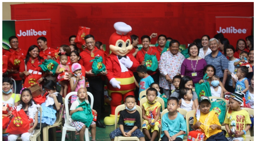
Jollibee mascot merrymaking with Pedia patients

The "Maaga ang Pasko" caravan tendered by Jollibee on the 25 th of November 2015 for the PGH pediatric patients was characterized by gift-giving and the partaking of sumptuous Jollibee products. The affair became more meaningful with the proposed grant of Php 1.0 Million for the benefit of PGH charity patients through the PGH Medical Foundation Inc. The amount is earmarked for the purchase of medical instruments for the Hema-Oncology Unit of the Department of Pediatrics and for the enhancement of the PGH Medical Foundation Charity Patients Medical Fund.